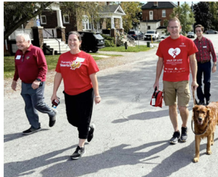
RMH hosted our Thankful Hearts Walk on October 2, raising funds for our Cardiac and Pulmonary Rehabilitation Program. The walk serves as a wonderful gathering of current and former program participants, their families, community members, and team members, all united for the cause of exceptional care.