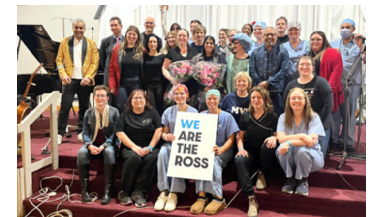
RMH physicians, with the help of fellow RMH staff and community partners, came together to host a Medical Variety Rounds Show at Celebrations in Lindsay on December 18, 2025.

With acts including Surgeon Man, the Specialty Support Line, and The 12 Days of ER, RMH physicians hosted a Medical Variety Rounds Show in December that was a resounding success, both in terms of fundraising for the WE ARE THE ROSS capital campaign, and for the connections it built between physicians of all ages and the community they care for. The show featured healthcare-themed comedy, musical talent, and dancing, showcasing the boundless skills of RMH physicians supported by a cast of RMH staff and community partner organizations. Through ticket sales and donations, $3,505 was raised for our RMH Foundation.