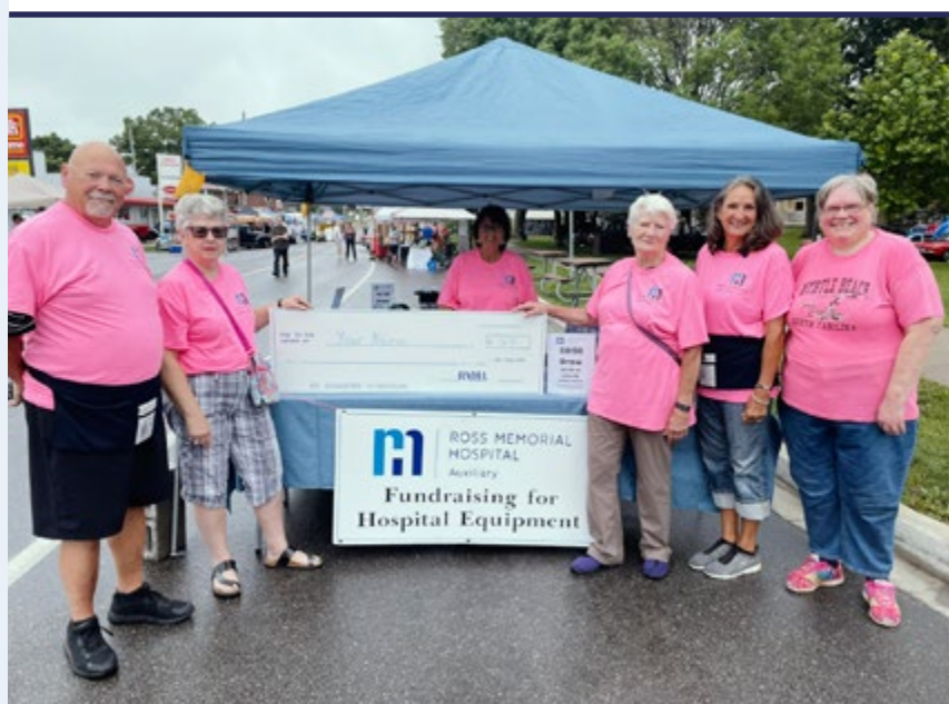
RMH Auxiliary Volunteers didn't let a little rain prevent them from running a successful 50/50 draw at Classics on Kent in downtown Lindsay on July 21, 2023. The event proved a success, raising $1,280.50 to help go towards the purchase of medical equipment for the hospital.

RMH's Auxiliary of roughly 125 volunteer members worked diligently to support the hospital throughout the year. The Auxiliary operated the Reflections Café and Reflections Gift Shop, introducing marketing campaigns along with new products and items to bolster sales. They also provided direct assistance to RMH team members and patients throughout the hospital in a number of ways, including within the Emergency Department and Flato Developments Ambulatory Care Centre.