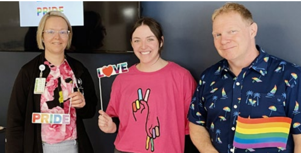
RMH hosted our first Pride Week in July, distributing educational materials to team members and holding events including musical performances from local 2SLGBTQI+ community members.

RMH's BRDD Collaborative was formed in September to provide specific focus on diversity, equity, and inclusion work. The BRDD put forth an RMH Equity Framework that was approved by our Board of Directors, made educational opportunities available to team members, and created Rapid Access Clinic awareness to identified underrepresented communities that led to RMH being invited and participating in a Health Fair hosted by Mississaugas of Scugog Island First Nation in January.